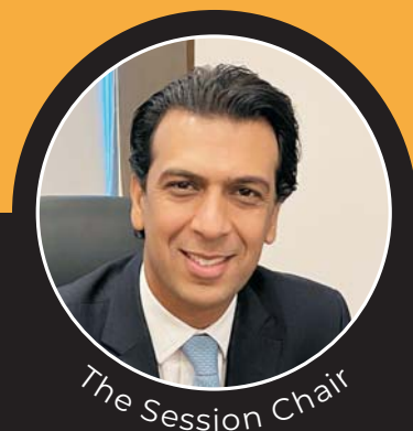
The Session Chair

Futurist, Bestselling Author, Global Fintech Superstar, and Expert on Disruption in Banking