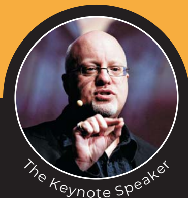
The Keynote Speaker