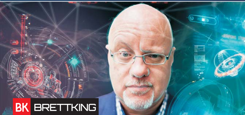
BK BRETT KING

How banks must evolve to meet customers' expectations in the Covid-19 world